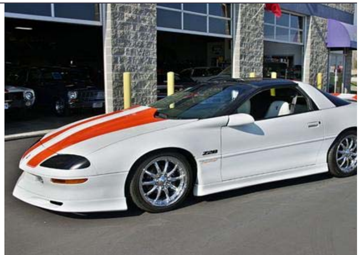
1997 Chevrolet Camaro Z28 30th Anniversary Edition For Sale